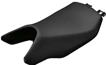
3 High rider's seat, black