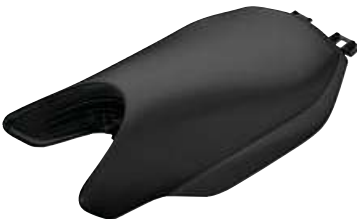
4 Sport rider seat, black