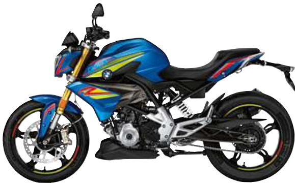
1 Decorative Street sticker set