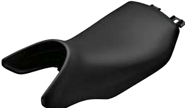
2 Rider seat, black