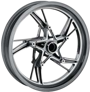
1 Option 719 Classic front wheel