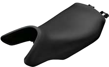
1 Low rider seat, black