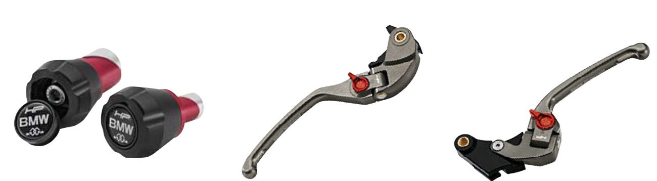
2 Folding HP clutch lever