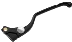
1 Handbrake lever, adjustable