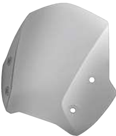
2 Sport windscreen, tinted