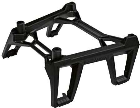
LUGGAGE GRID NEW LARGE TANK BAG NEW SMALL TANK BAG NEW