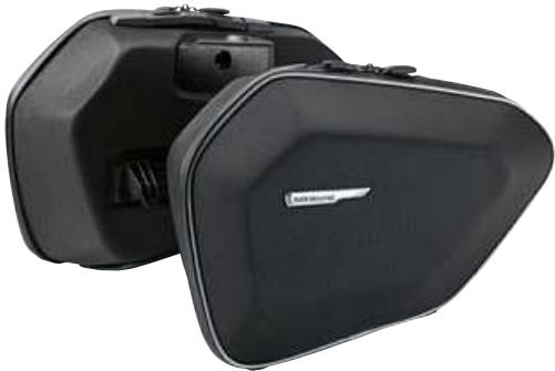
1 Soft bag NEW 2 Soft bag case holder NEW

The high-quality soft bag made of durable polyester convinces with practical details and a storage volume of 20 litres. Features such as the waterproof liner, the all-round zipper, the carrying handle and the quick-release fastener for easy mounting on the motorcycle ensure a secure hold and practical handling. The sturdy case holder allows easy and secure installation of the soft case. Even if the case is not mounted, the discreet black holder is hardly noticeable on the bike.