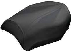
5 Comfort passenger seat, black