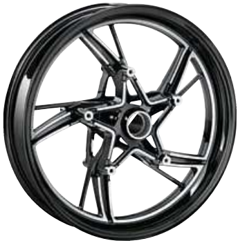
1 Option 719 Sport front wheel