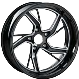
1 Option 719 Sport rear wheel