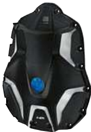
HP ENGINE HOUSING COVER, FRONT

The HP engine housing cover made of anodised aluminium also adds to the bike's sporty character. The high-quality milled cover and HP branding emphasise the high-performance standard and also guarantee an attractive customisation of the bike.