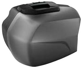
1 Touring case in Asphalt grey metallic matt