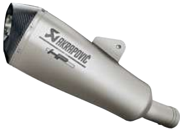
HP SPORT SILENCER

Made entirely out of titanium and stainless steel and to an exceptional level of craftsmanship, this slip-on silencer delivers a powerful rumble. It's also remarkably lightweight.