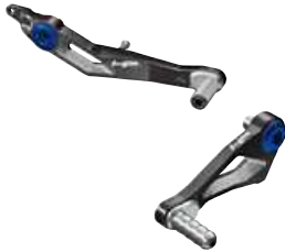
HP FOOT LEVER, ADJUSTABLE

The milled HP foot levers made of anodised aluminium are adjustable and come in sporty black/blue/silver. Adjusted to match, the foot levers can also be operated better and more sensitively when riding on large inclines. The exclusive look with HP logo also emphasises the bike's performance-based character.