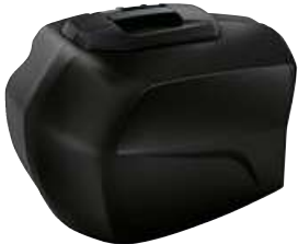
2 Touring case in Black storm metallic