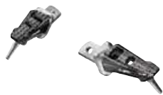
HP RIDER FOOTRESTS, ADJUSTABLE

The HP rider footrests are adjustable in three positions and offer a high level of comfort in addition to ergonomic qualities. The high-quality milled parts made of anodised aluminium can be adapted to a sporty riding style or different rider statures and thus ensure even better control, for example in an inclined position.