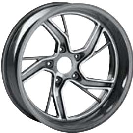
1 Option 719 Classic rear wheel