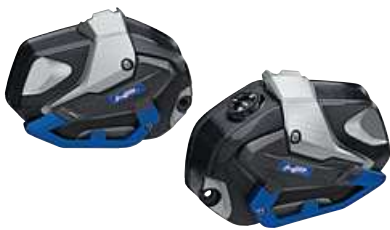
HP CYLINDER HEAD COVERS

The HP cylinder head covers made of anodised aluminium give the boxer engine an attractive appearance. The high-quality milled covers and HP branding highlight the motorcycle's sporty character. The HP oil filler plug perfectly matches the cylinder head covers.