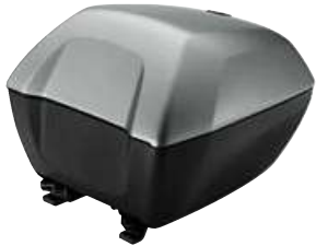
1 Asphalt grey metallic matt