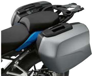
3 Touring case Granite grey metallic matt